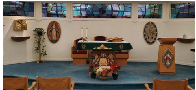
Altar at Vincentian Provincial Home

The Annual Easter Flowers Collection will take place on April 2. When listing your intentions please print neatly and carefully as they will be printed in the bulletin in honor of or in remembrance of friends and loved ones.