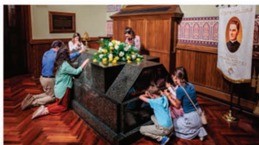
People can invoke the intercession of Blessed McGivney at his tomb in St. Mary Church in New Haven, part of Blessed Michael McGivney Parish. His remains are placed in a sealed, double bronze coffin within a polished granite sarcophagus at the rear of the church.